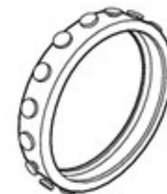
PosiTrax® Tire (part# C13) available as an accessory for fiberglass and tile pools.

NOTE: Black Max™ parts are not indicated on exploded parts diagrams. See Black Max Parts List on pages 363-365.