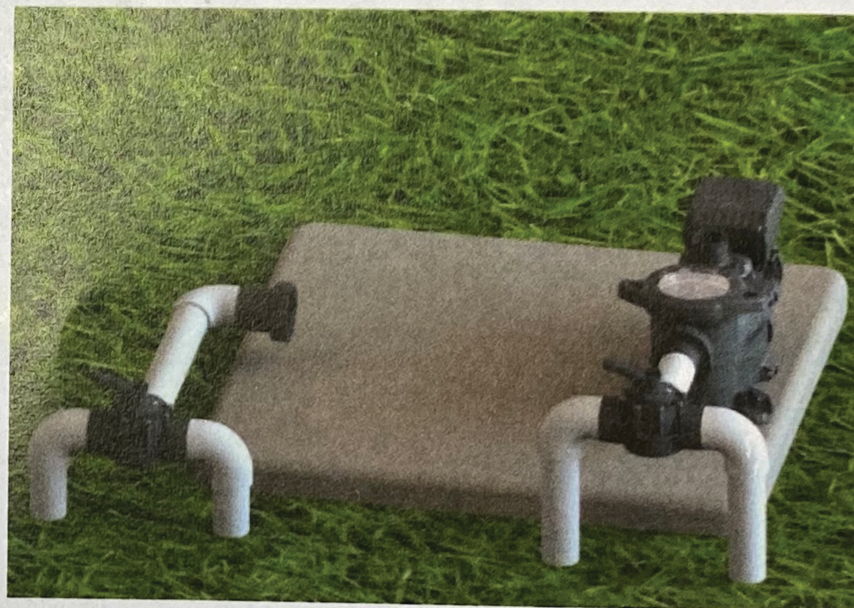
Step 2: Plumb new filter outlet union & remove pump outlet plumbing. Note: SwimClear outlet is same height as StarClear Plus.