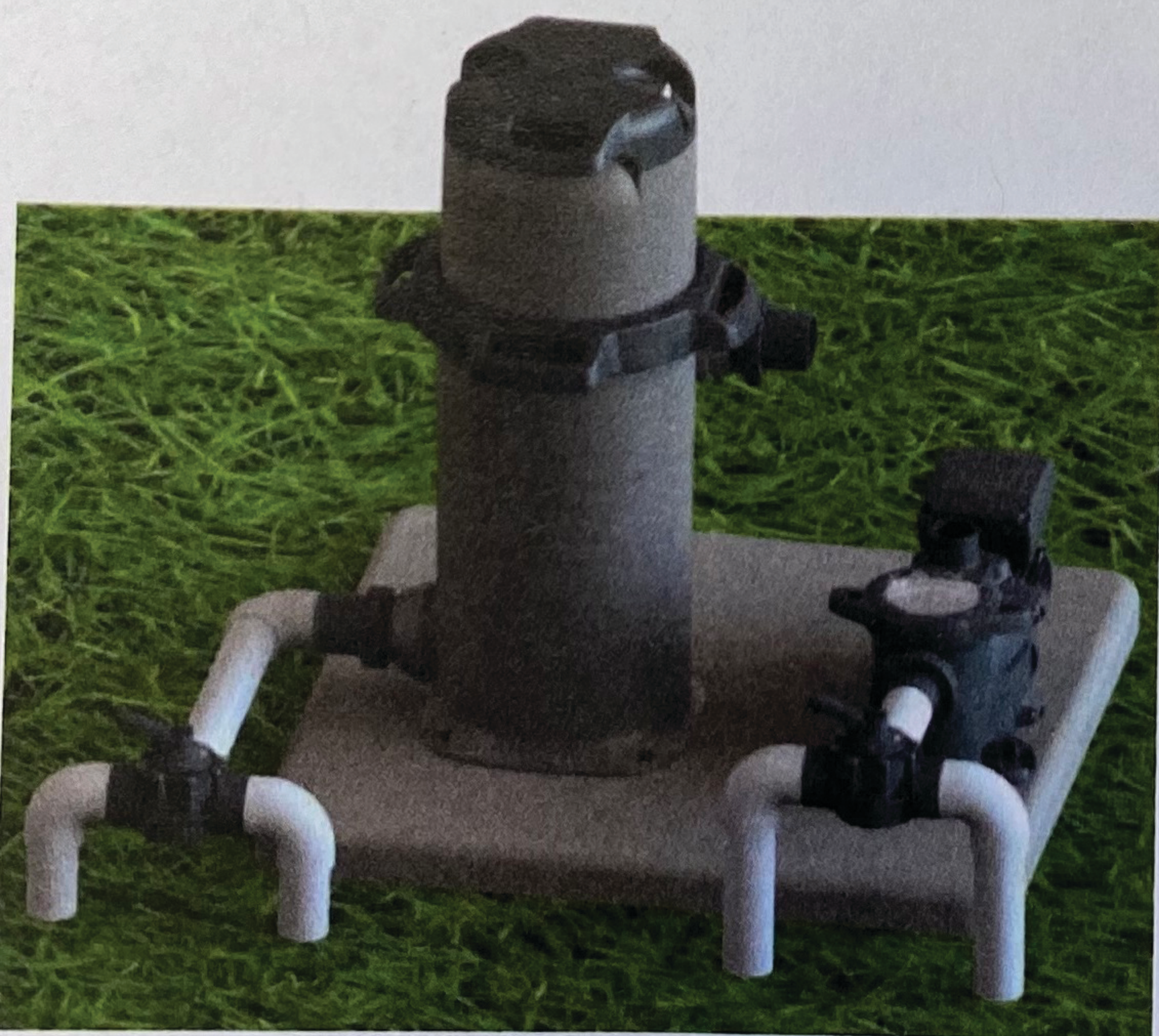
Step 3: Connect SwimClear to outlet union.