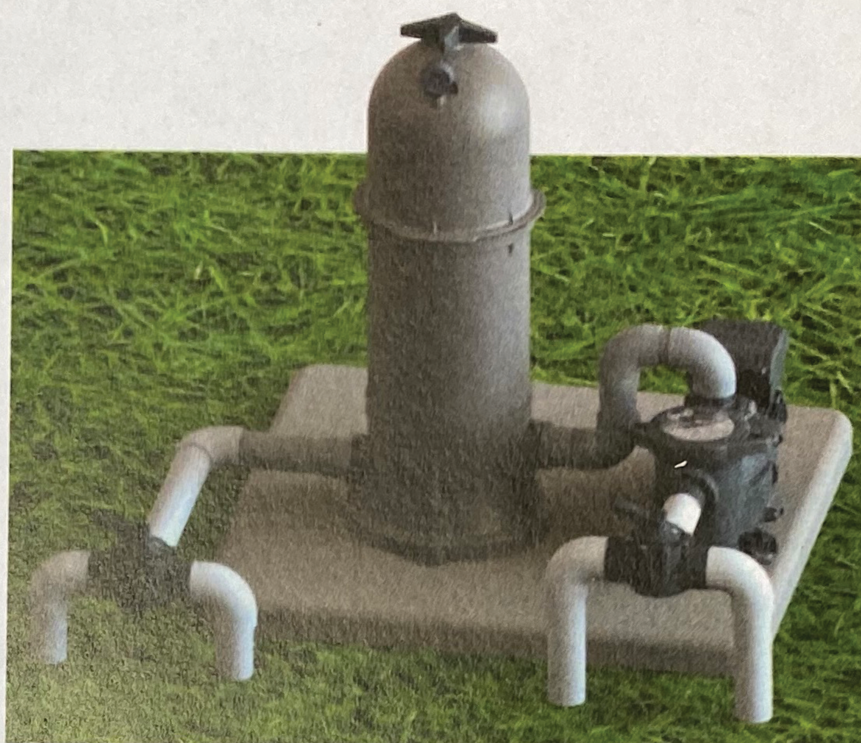
Existing StarClear Plus filter to be replaced.

For additional assistance, please contact Hayward Technical Service at (908) 355-7995.