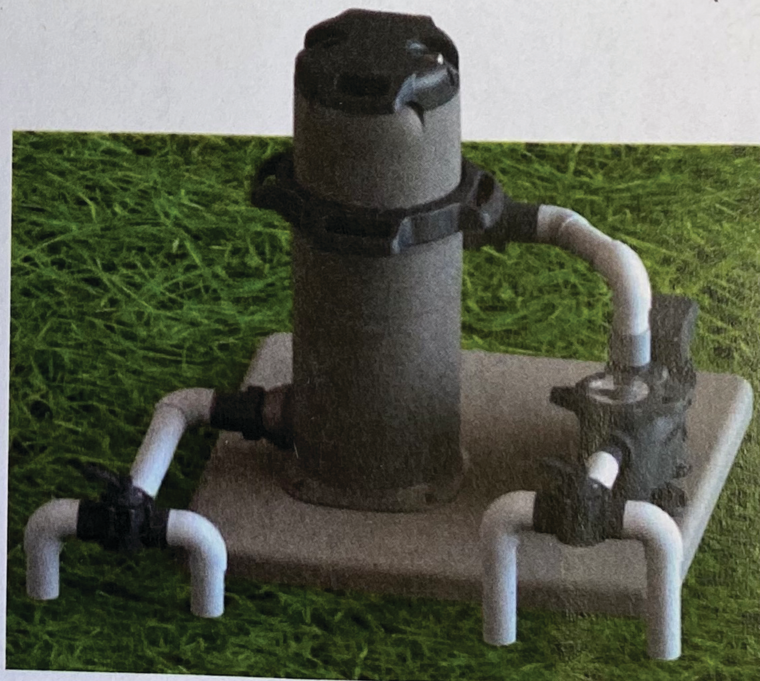
Step 4: Plumb pump outlet to filter inlet (45 degree plumbing recommended for hydraulic efficiency).