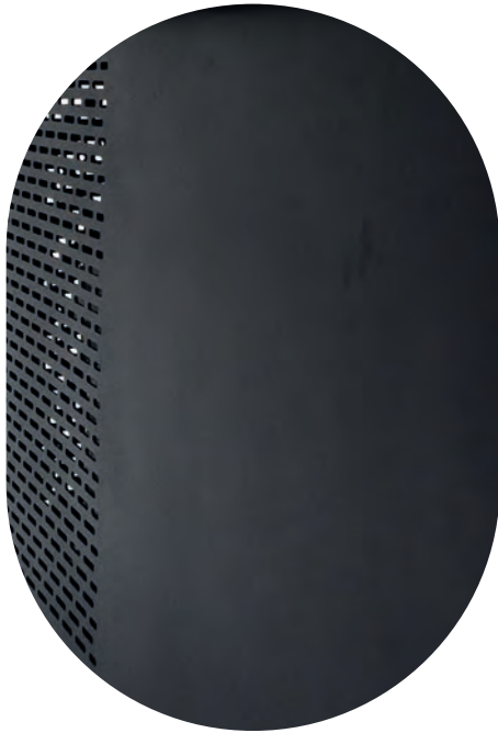
Black Aluminum Surround