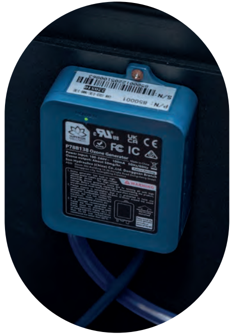
Ozone and Filtration systems